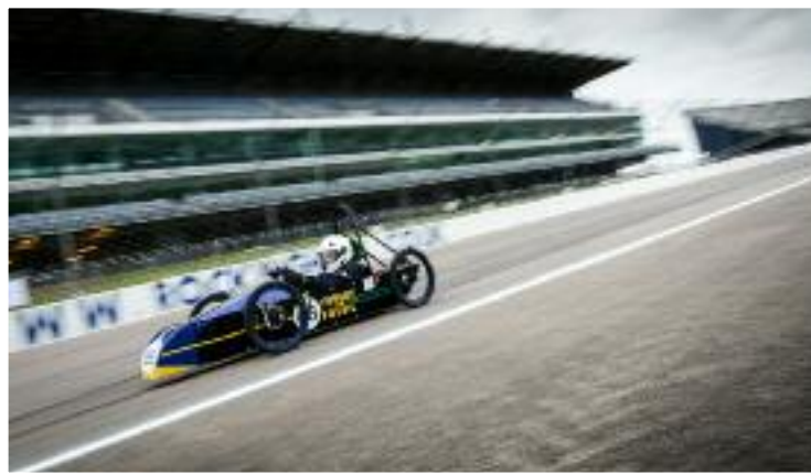
The two schools we are sponsoring; Presdales and Ashlyns, are starting to build their vehicles and get their teams together. At the time of writing both schools are in the midst of GCSE and A Level work so a more in depth report will be in the next edition.

We have ambitious targets for Project Blyth, and anticipate this being a game-changer for Greenpower, paving the way for similar large-scale projects throughout the UK. If you’d like to get involved, and be part of this exciting journey, please get in touch. info@greenpower.co.uk / 01243 552305